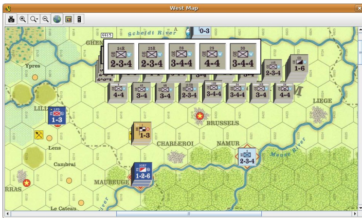
Figure 9: The stack viewer, displaying the contents of a stack of pieces

Most Vassal modules include a stack viewer. Hold your mouse cursor over the stack and the component pieces in the stack will be displayed, left to right.