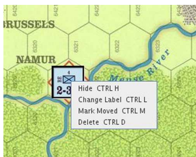
Figure 8: A sample command menu, showing 4 commands and associated hotkeys

Use of the command menu will vary from module to module. In some modules, all piece control, even movement, is performed by right-clicking and choosing a command. In some, the right-click menu is more modest and contains only a few simple commands, such as to clone or delete the piece.